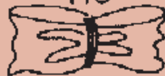
Fig 3. Using wire edged ribbon

Photographs by Jonathan Farmer. Illustrations by Mandy Shaw.